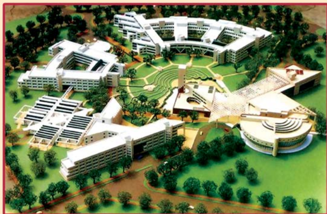
Aerial view of institutional complex, DTU Shahbad Daultpur, Main Bawana Road, Delhi-110042