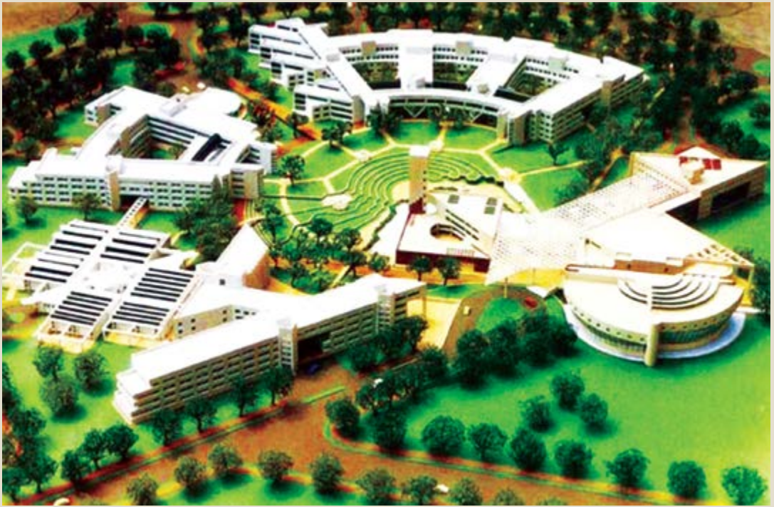
AERIAL VIEW OF INSTITUTIONAL COMPLEX, DTU, SHAHBAD DAULATPUR, MAIN BAWANA ROAD, DELHI-110042