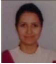
INDU 2K10/SPD/03 M. Tech. (Signal processing & Digital Design) 2011-12