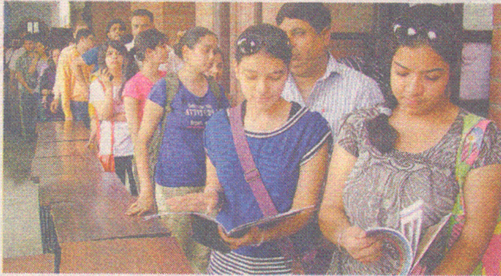
Students and parents make a beeline for admission forms at St Stephen's College on Wednesday

The trials for admission in sports quota will be conducted by individual colleges. To ensure a fair trial, last year the trials was conducted by the DU. But this year again it will be conducted